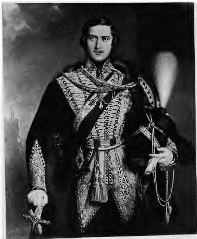
H. R. H. The Prince Consort 1840 From the portrait by John Partridge at Buckingham Palace.